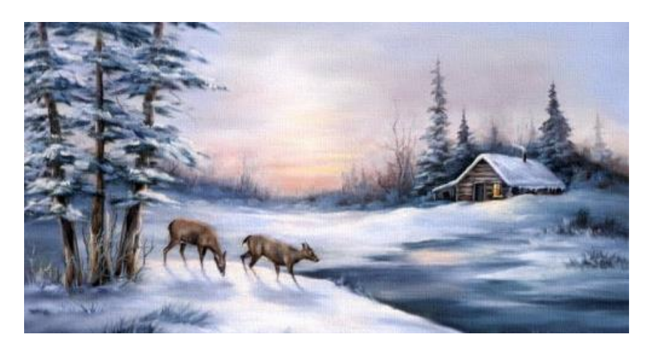
"Winter is the time for comfort, for good food and warmth, for the touch of a friendly hand and for a talk beside the fire: it is the time for home."